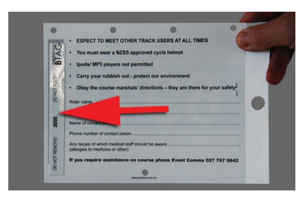
Thread cable ties through holes

Please follow these instructions to ensure optimum performance from your ChronoTrack timing tag