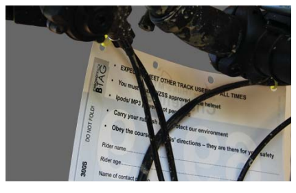
Numberplate in place